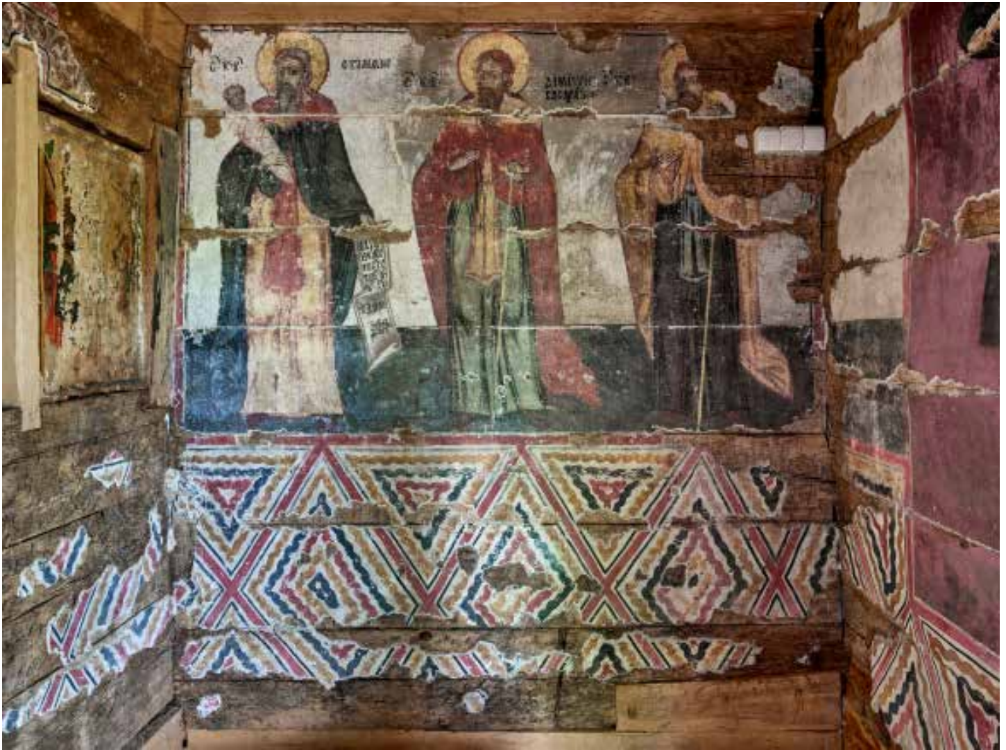
Above: The south wall of the narthex features full-length figures of saints. The abstract pattern in the lower register of the wall is intended to suggest marble. The names of the painters of the mural scheme appear above the oblation table, or proscomidie, that stands to the left of the altar. Gheorghie is specifically identified as 'painter from Urși'. The inscription includes the date May 27, 1843.