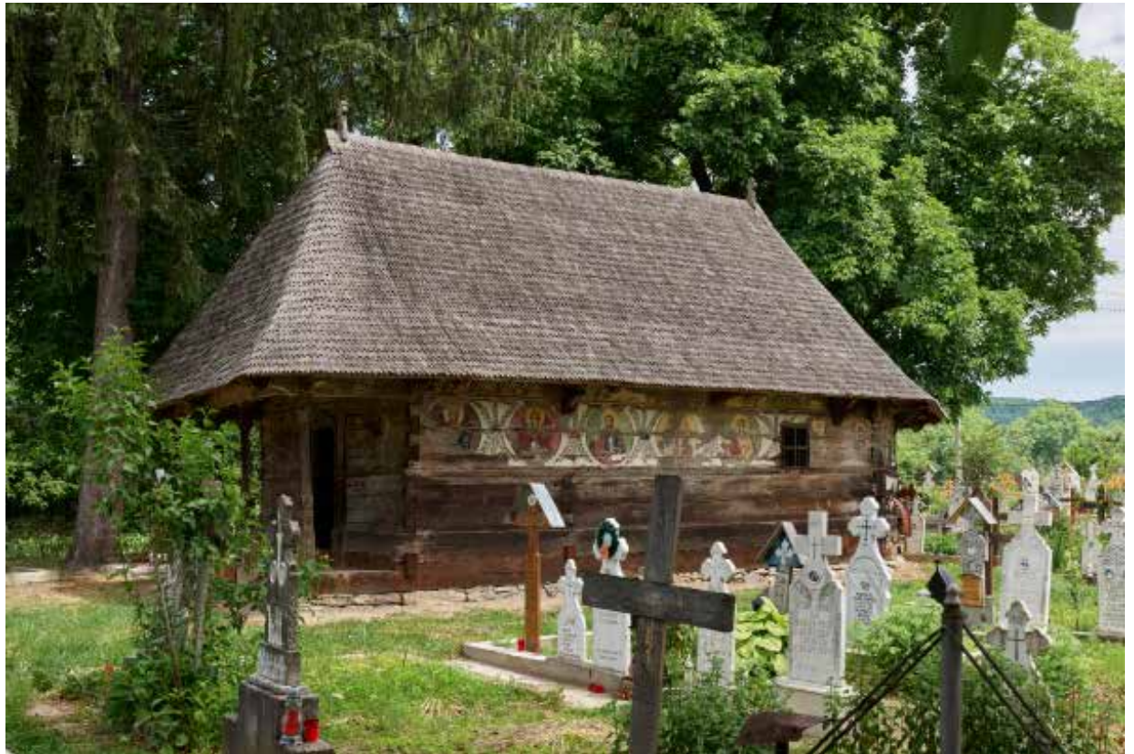
A south-west view of the Wooden Church of Urși across the graveyard. Its walls are made of squared logs and are decorated externally with figurative roundels and floral patterns. The roof is shingled and to the left is the outer porch or exo narthex, which leads into a narthex or internal porch