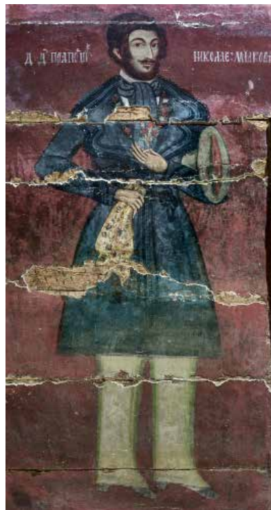
The fashionable whiskers sported by the patron of the church on the west wall of the narthex are an unexpected contrast to the timeless Byzantine character of the other wall paintings. He holds a bunch of flowers in his hand and a hat in the crook of his arm